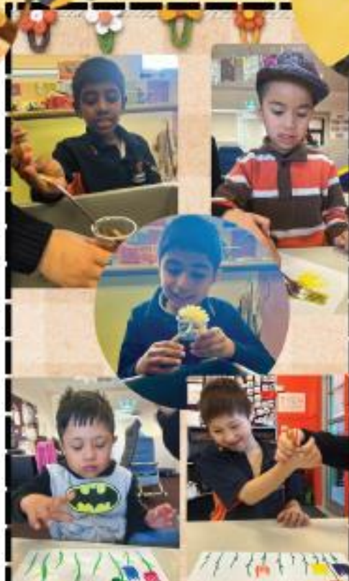
Making spring crafts and experiments!