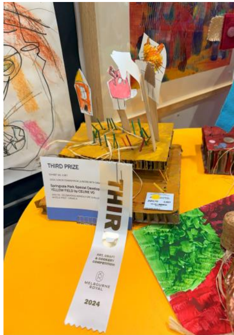
Celine V. (Yellow Field)