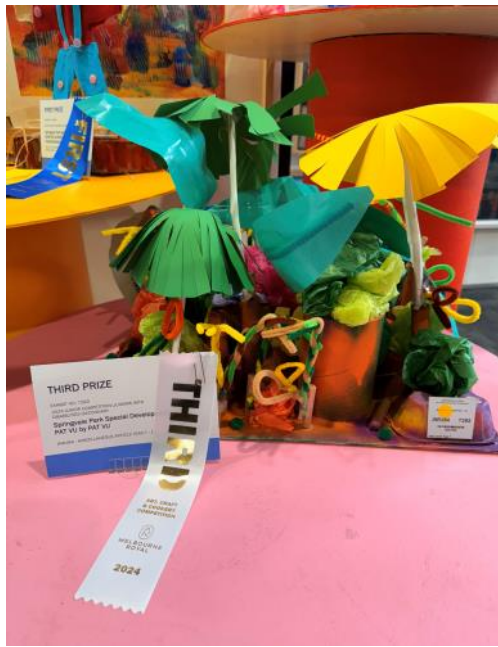
Pat V. (Tree Alive)