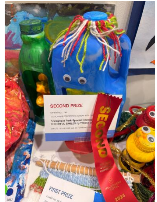
Teejay L. (Cheerful Smiles)