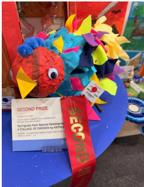
Kathleen K. (Collage of Chicken)