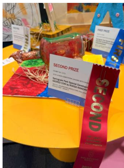
Roksa R. (Sacred cow)