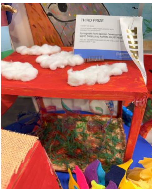
Aaron A. (Wind Swirls)