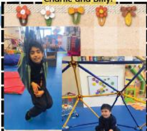
Burning the energy at We Rock Spectrum Playcentre!