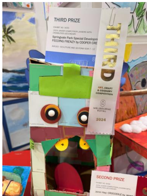
Cooper C. (Feeding frenzy)